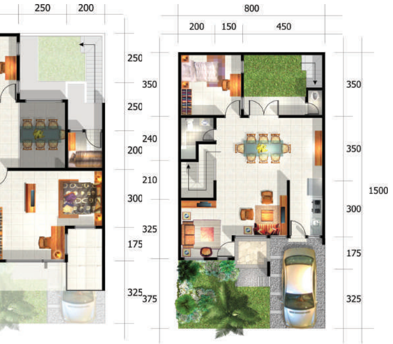
Denah Lt. Atas Type Adenium